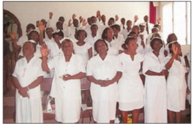
Above: The choir of the Haitian Missionary Baptist Church.

“The biggest problem I’ve had this week is that they serve pork for almost every meal,” she said with a laugh. “I’ve been living on peanut butter.” The Good Samaritan Hospital, where many of the volunteers worked during the week, is a Baptist hospital run through the Haitian Missionary Baptist Church.